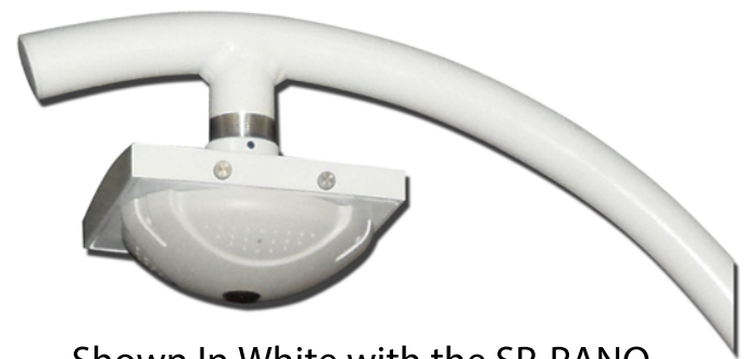
Shown In White with the SP-PANO Panoramic Dome Camera Mount.